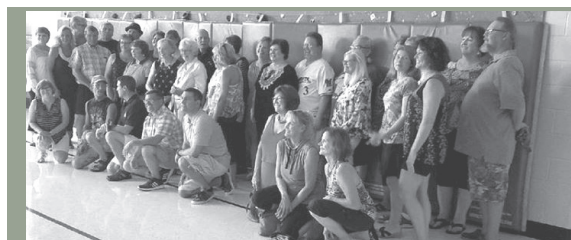
The Cormier "Kids" Alumni group met at Cormier School on Saturday, September 23, for some reminiscing.